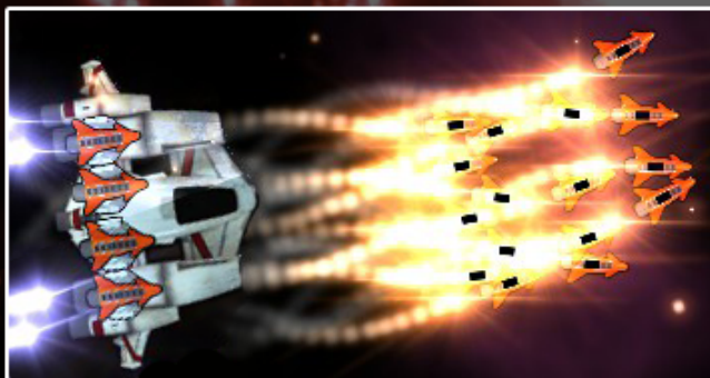
Barage Heavy Cruiser