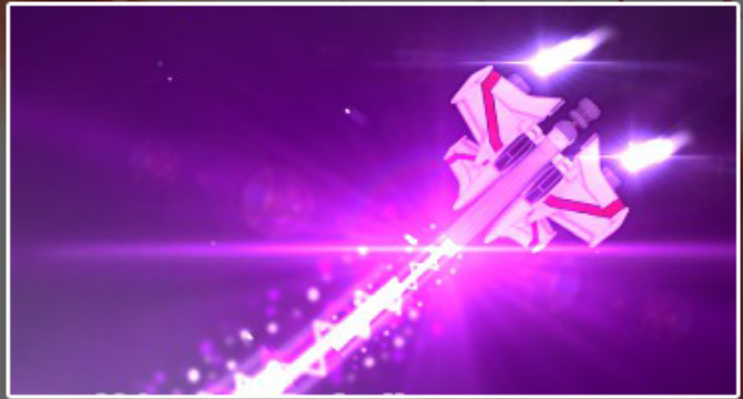
Rapier Beam Cruiser