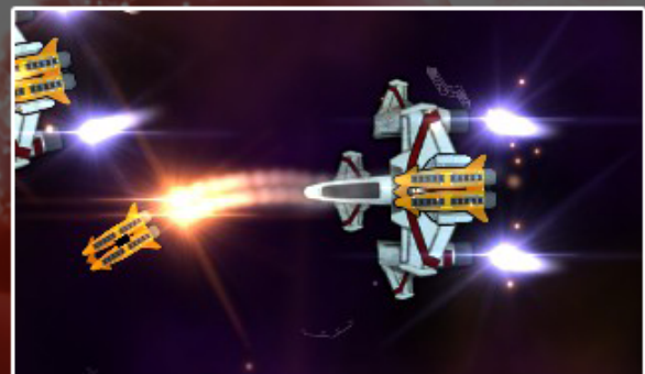
Cobra Attack Ship